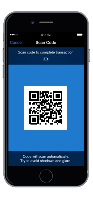
SCAN QR CODE